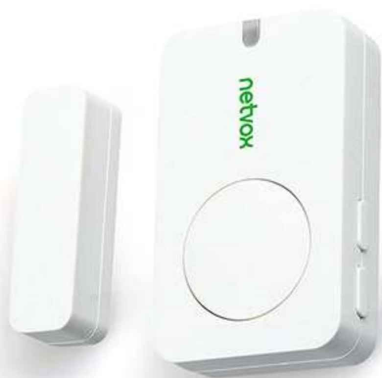
Built-in sensor Simple design