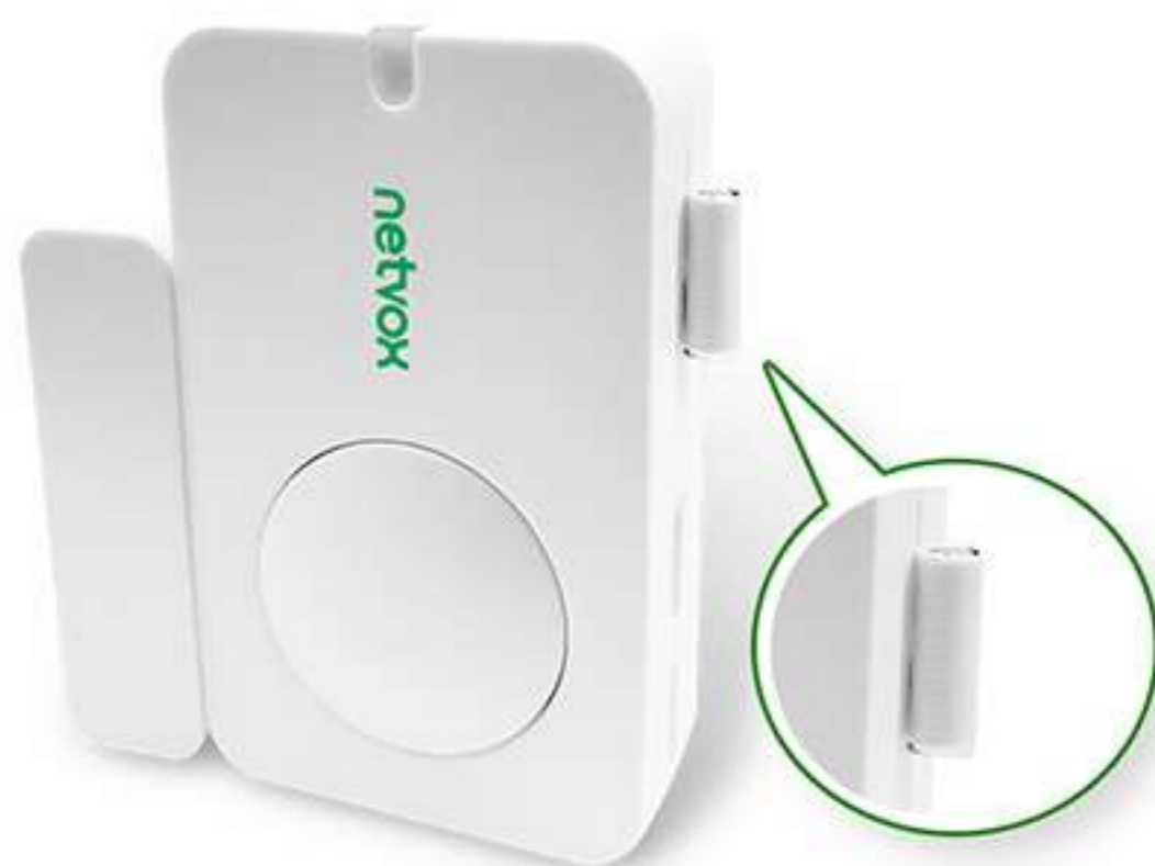
External sensor Stable performance